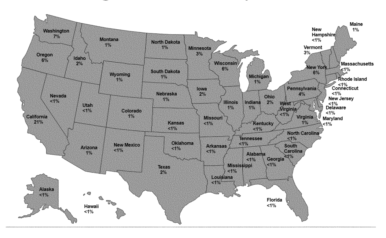
Figure 1 above shows the distribution of organic production by volume across the U.S. Of total organic production across the U.S., California accounts for 21 percent. Based on NASS 2014 Organic Survey data, California produces the majority of the volume in most agricultural commodities. In descending order, California produced the following portion of organic agricultural commodities across the U.S.: 63 percent of nuts, 57 percent of vegetables, 50 percent of poultry (excluding eggs), 27 percent of fruit, 23 percent of dairy products, 23 percent of beef cattle, and 10 percent of field crops.

After California, Washington State is the next largest producer of organic commodities in the U.S. with 7 percent of total volume. The majority of Washington's production is in fruit, with 64 percent of the total organic noncitrus fruit production volume in the U.S. Florida's citrus industry accounts for 2 percent of all organic fruit production and 16 percent of U.S. organic citrus production. Washington also accounts for 12 percent of egg production, 6 percent production of vegetables, 5 percent of beef cattle, 3 percent of dairy products, and 1 percent of field crops.