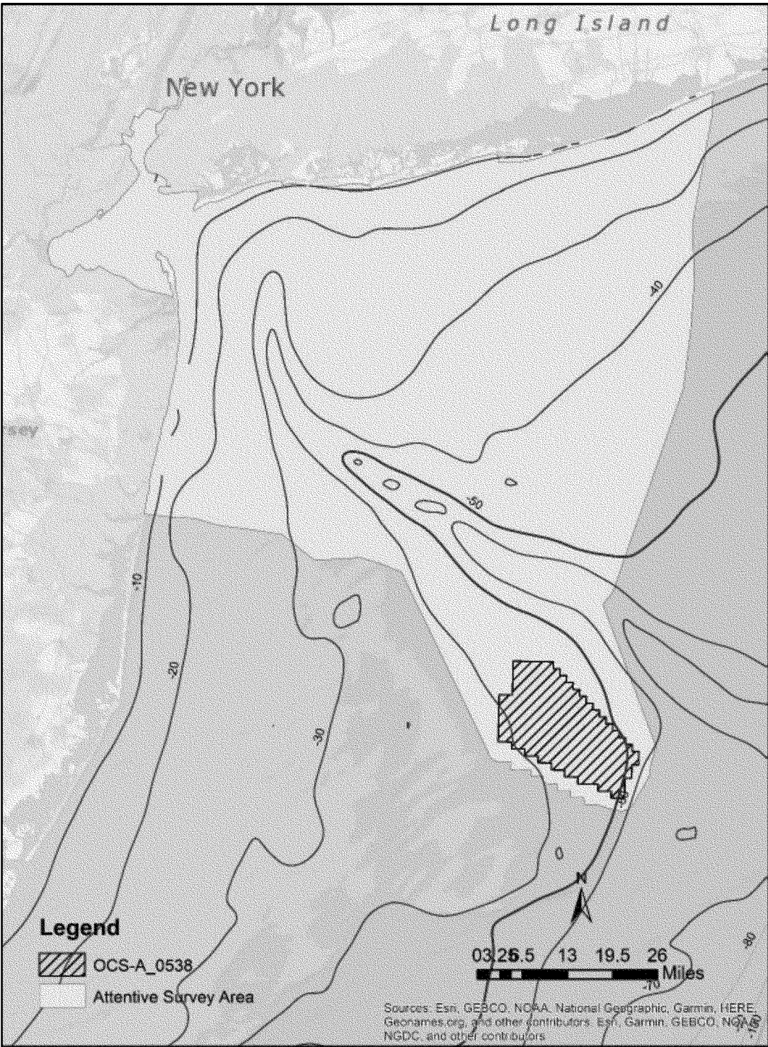
Figure 2 -- Proposed Survey Area with Bathymetric Contours Showing Water Depth

AE's marine site characterization surveys include HRG surveys and geotechnical sampling activities within the Lease Area and the ECR area. The total HRG survey tracklines for the