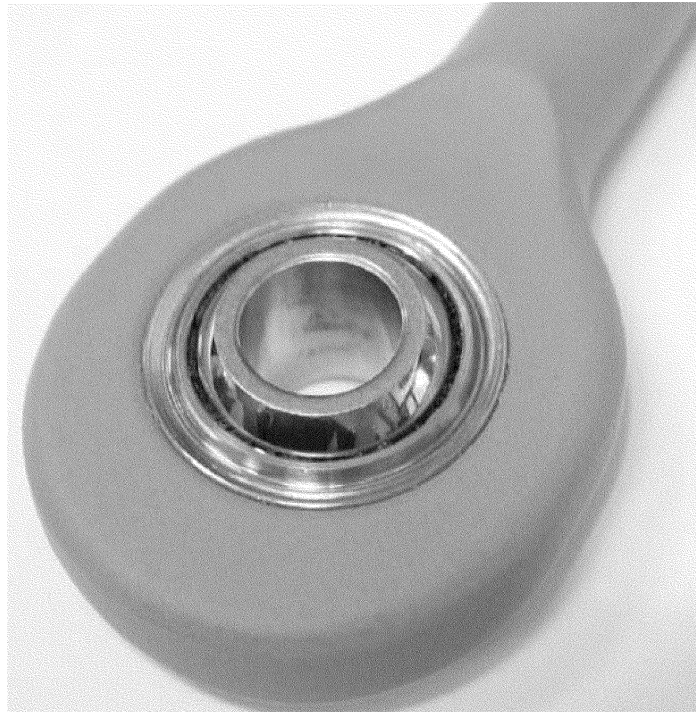
Figure 2 to Paragraph (e)

chamfer as shown in Figure 2 to Paragraph (e) of this AD.